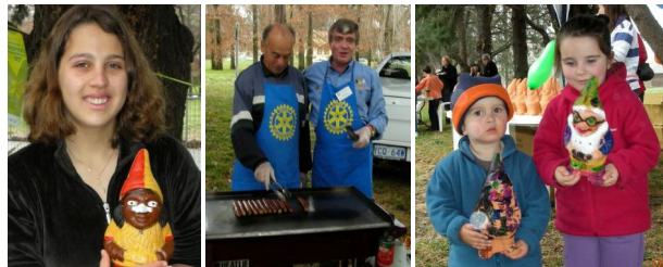
Spot the Gnome